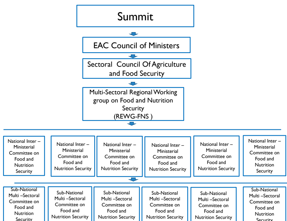
Figure 2: The Technical Implementation Institutional Framework